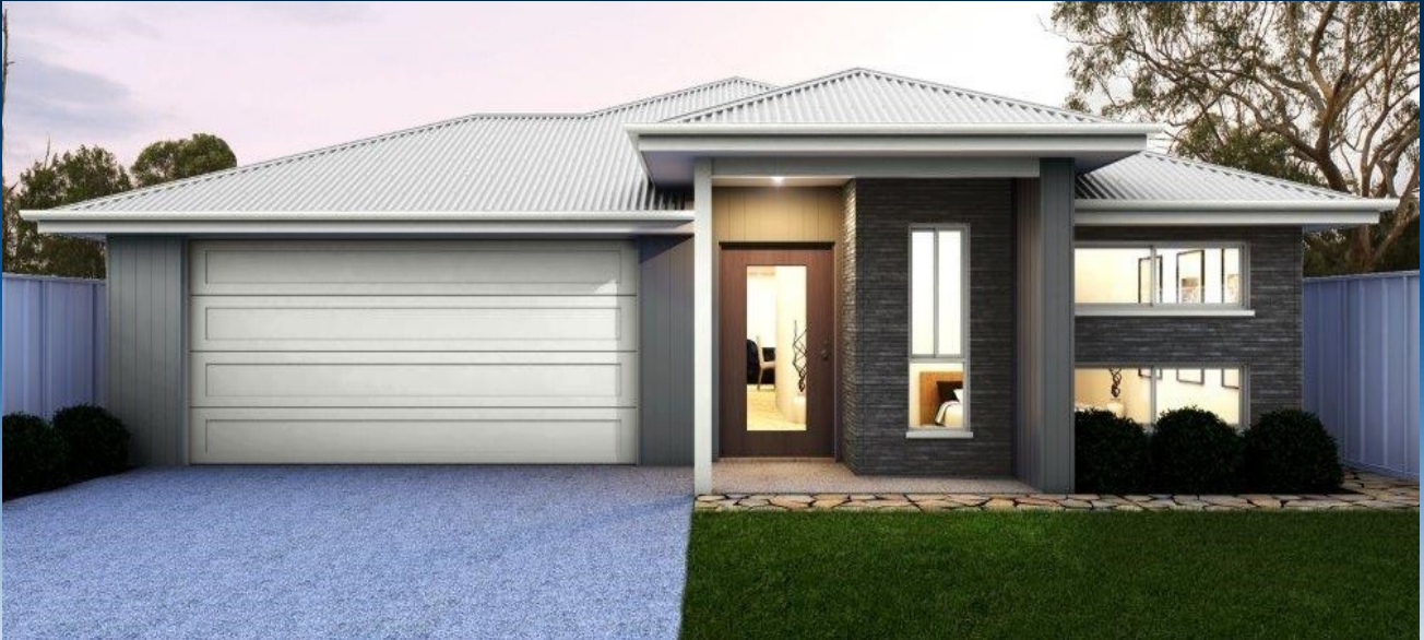
Image for advertising purpose only